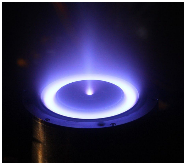
Figure 1: ACE Max krypton operation