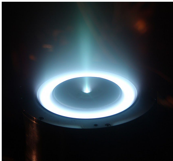
Figure 2: ACE Max xenon operation

ACE Max is a kilowatt class propulsion system using krypton or xenon propellant for missions requiring high total impulse per thruster. ACE Max is ideal for communication satellite constellations, for small GEO spacecraft, and as an enabling technology for high throughput LEO, GTO-GEO transfer, and cislunar missions. ACE Max includes a magnetically shielded thruster which is tuned to optimize performance with krypton propellant. The thruster is matched to an Apollo radiation-hardened, 95% efficient, single board PPU, a propellant management system with flight heritage components, and a COPV tank sized to fit customer mission requirements. ACE Max has been selected for programs such as a GEO mission and a commercial constellation with several hundred satellites.